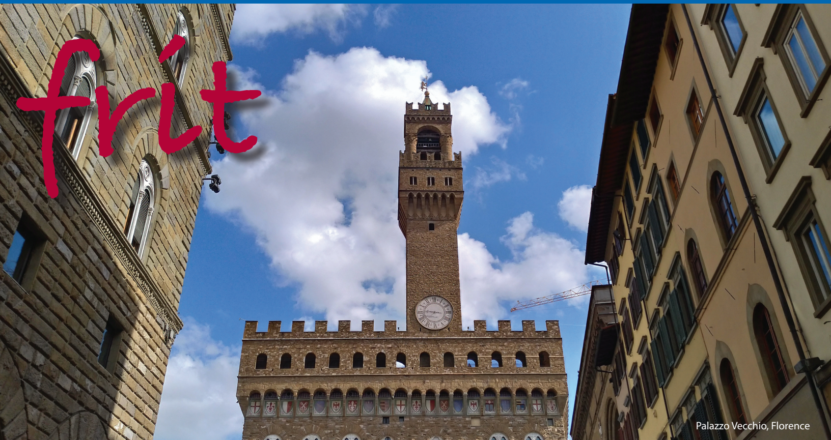
Palazzo Vecchio, Florence